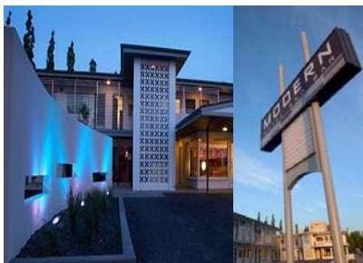
Modern Hotel 1314 W. Grove

Parking for Friday Reception (park in A St. Garage. From Front St. Turn right opposite of A St. ... $1 hr.)