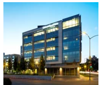
U. of Idaho Water Ctr. 322 Front St