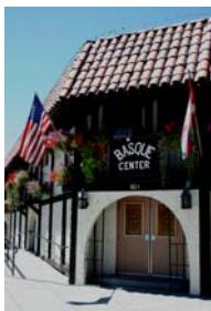
Basque Ctr 611 Grove